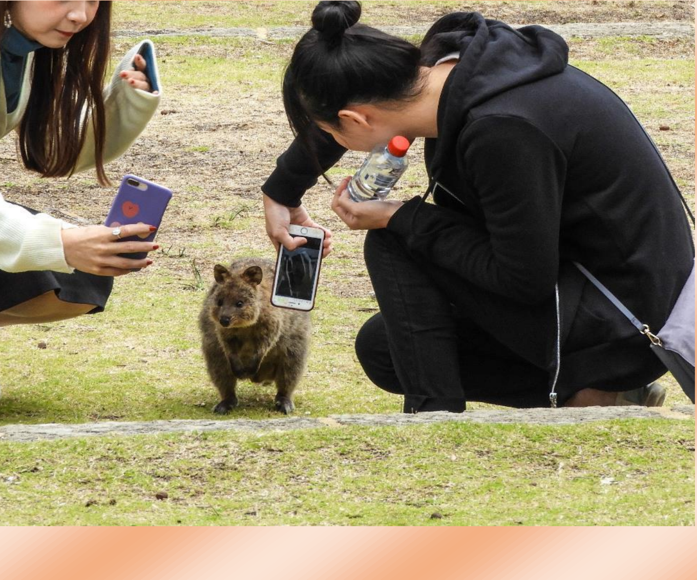
... pose for pictures,