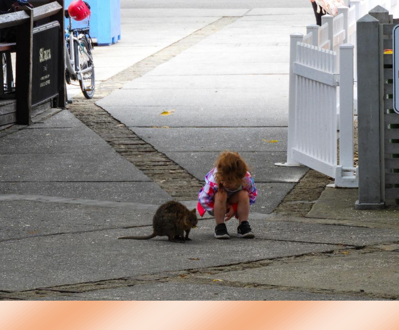
... if you want to tell him your secrets...