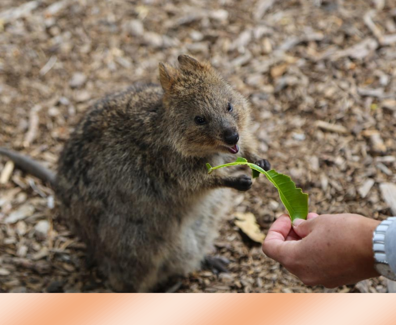
... eat leaves from people's hands,